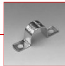
2FAC3905 PLACA UNIVERSAL P/13950 3905 FAMATEL